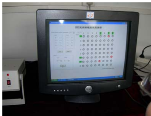
System & Operator